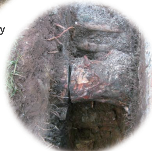
Severely cut / damaged root 根部被嚴重切割或損害