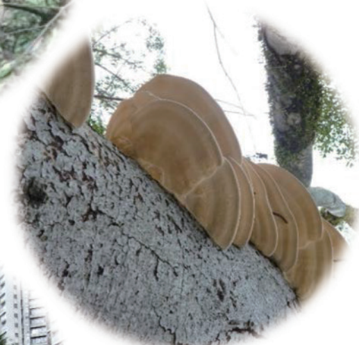
Fungal fruiting bodies 真菌子實體