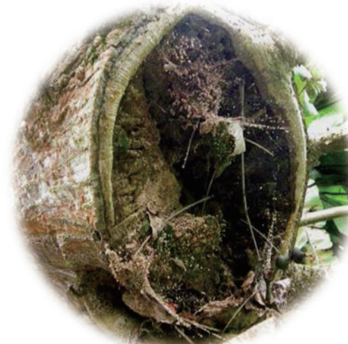
Wood decay / cavity 腐壞／樹洞