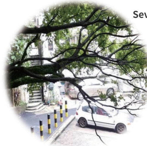
Dieback twigs 樹枝枯死