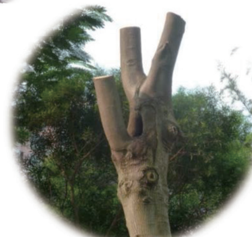
Topping / improper pruning 截頂／不適當修剪