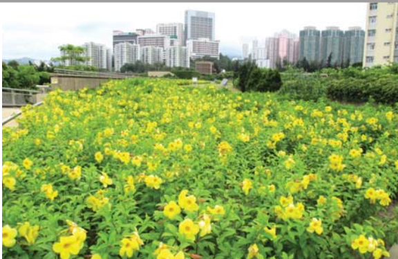
位於荔枝角公園的平台花園 Podium planting at Lai Chi Kok Park