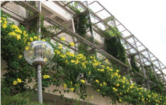
植物的下垂習性有助美化建築物外牆 Drooping habit of the plant screens the vertical wall of the building