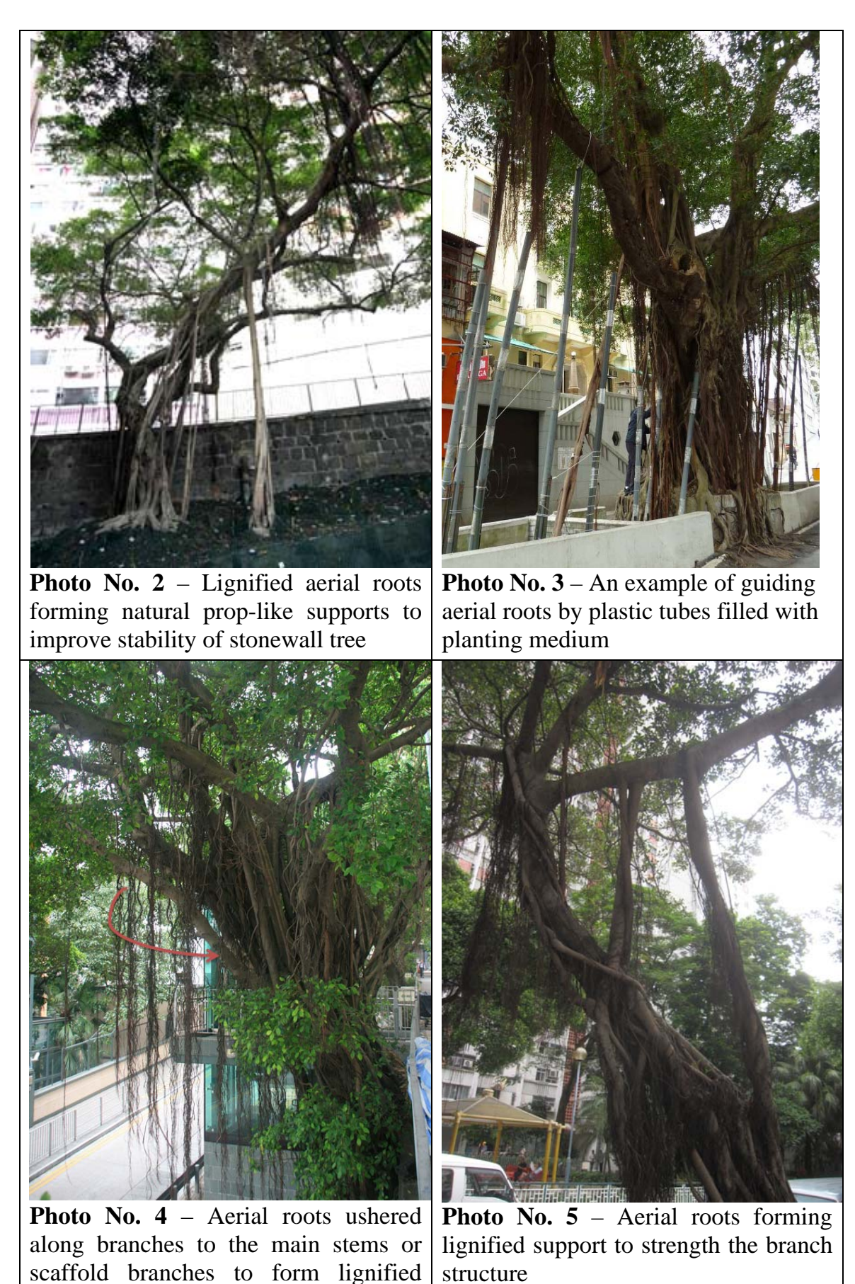
- 11 -