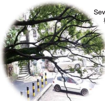
Dieback twigs 樹枝枯死