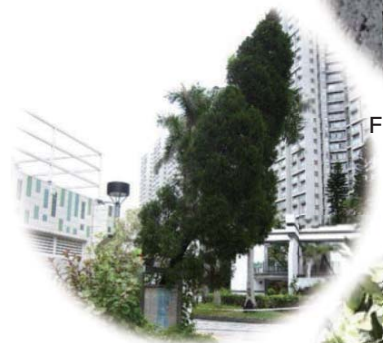
Fungal fruiting bodies 真菌子實體