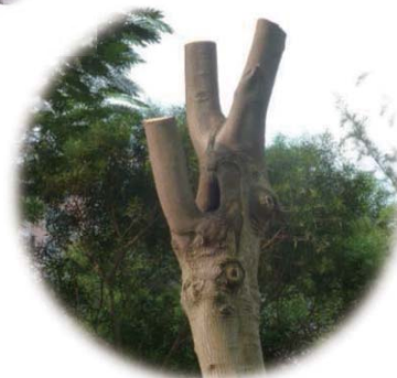
Topping / improper pruning 截頂 / 不適當修剪