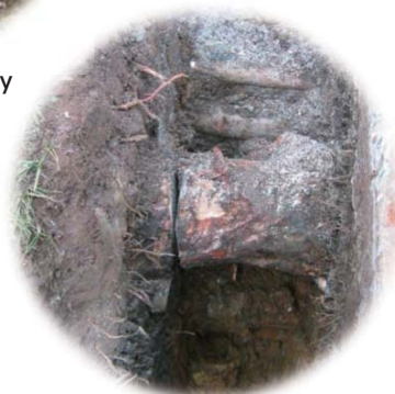
Severely cut / damaged root 根部被嚴重切割或損害