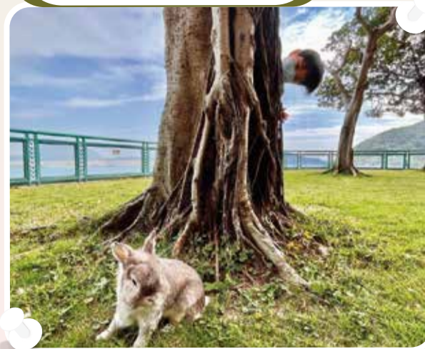
親子組別冠軍 - 林建博 Champion of Parent and Child Category