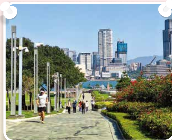
中學組別冠軍 - 蘇蕾 Champion of Secondary School Category