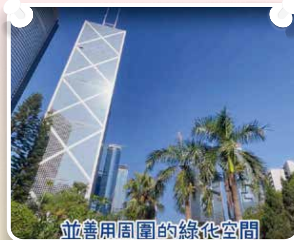
並善用周圍的綠化空間 短片公開組別冠軍 - 吳綺璿 Champion of Open Short Video Category

由發展局綠化、園境及樹木管理組主辦的「城市·友·園·人攝影及短片創作比賽」，已公布得獎名單，詳情請參閱以下連結。