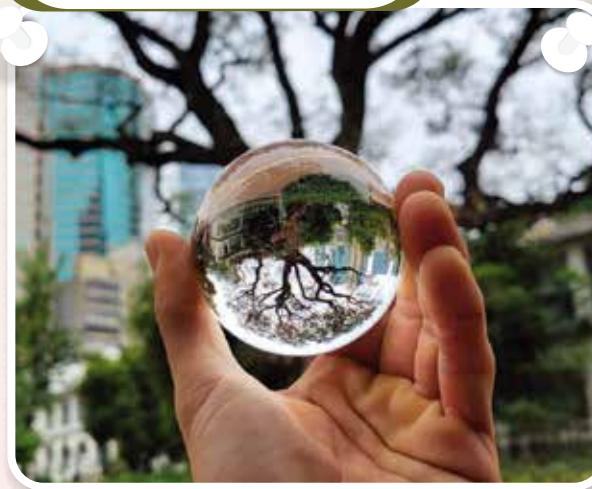
公開組別冠軍 - LAU Ka-chun Champion of Open Category