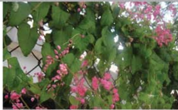
金屬網圍欄上的垂直綠化 Vertical greening on mesh fencing