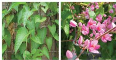
需要金屬網作支撐 Support with wire mesh 一簇簇粉紅色的花朵 Clusters of pink flowers

護理需求的考慮 Maintenance demand considerations