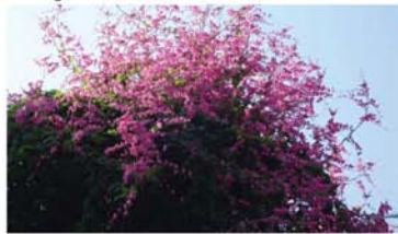
提供良好的綠色覆蓋並在夏天綻放大量色彩鮮艷的花朵 Provide good green coverage and full bloom in summer