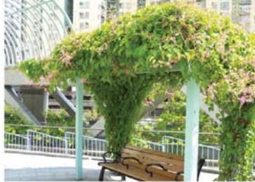
作陰棚植物 Planting on a shelter